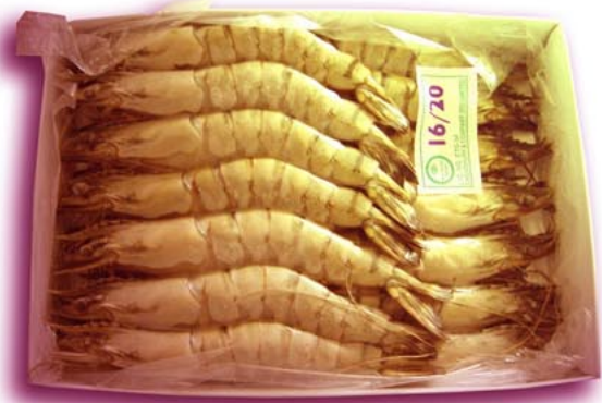
A. Black Tiger/Freshwater Head On Shell On Semi-IQF, in 1 KG net or 800 grms net, packing 10 X 1 KG = 10 KG / MC Sizes : U/5, 6/8, 8/12, 13/15, 16/20, 21/30, 31/40, 41/50, 51/60 pcs per KG