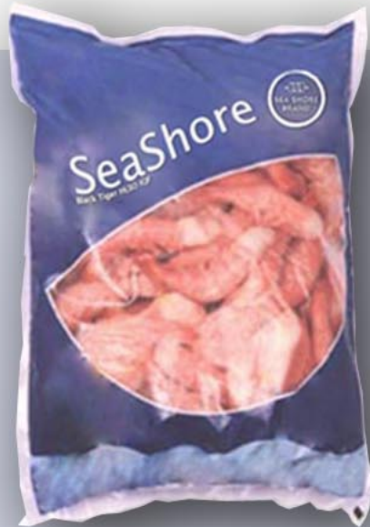
B. Black Tiger/ Freshwater Headless Shell on Shrimp Block Frozen, Semi IQF or IQF * Packing blocks 6X4lbs= 24 lbs/MC IQF " 10 X 2 lbs = 20 lb/MC Sizes : U/5,6/8,8/12,13/15,16/20,21,25,26/30,31/40,41/50,51/60, 61/70,71/90,91/110