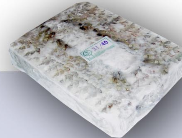
D. Black Tiger / Freshwater Peeled Tail on/off In Blocks, Semi-IQF or IQF* Packaging: blocks 6 X 4 lbs =24 lbs/MC, IQF * =2lbs X 10= 20lbs/MC Sizes : 8/12 pcs/lb to 41/50 pcs/ lb